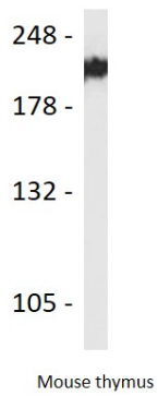
ARG40243 anti-CD45 antibody WB image

Immunohistochemistry: Paraffin-embedded Rat kidney stained with ARG40243 anti-CD45 antibody.