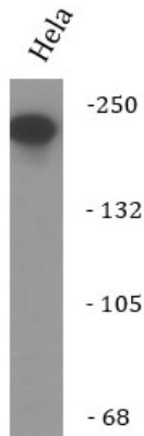
ARG46303 anti-MYH8 antibody WB image

Western blot: HeLa stained with ARG46303 anti-MYH8 antibody.