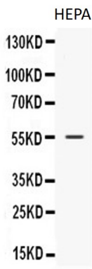
ARG59047 anti-NUCB2 (Nesfatin 1) antibody WB image Western blot: HEPA cell lysate stained with ARG59047 anti-NUCB2 (Nesfatin 1) antibody at 0.5 µg/ml dilution.