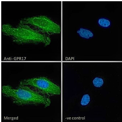
ARG65044 anti-GPR17 antibody ICC/IF image Immunofluorescence: Paraformaldehyde-fixed HeLa cells permeabilized with 0.15% Triton. Cells were stained with ARG65044 anti-GPR17 antibody (green) at 10 µg/ml dilution for 1 hour. DAPI (blue) for nuclear staining. Negative control: Unimmunized goat IgG (green) at 10 µg/ml dilution.